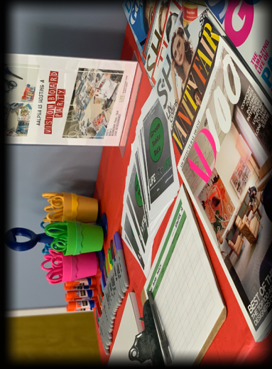
WINTER QUARTER 2019 VISION BOARD PARTY

AALPHA (African American Leaders Promoting Higher Achievement) promotes success and high impact engagement for students of African descent through comprehensive advising, developmental programming, student advocacy and structured learning experiences within an inclusive community.